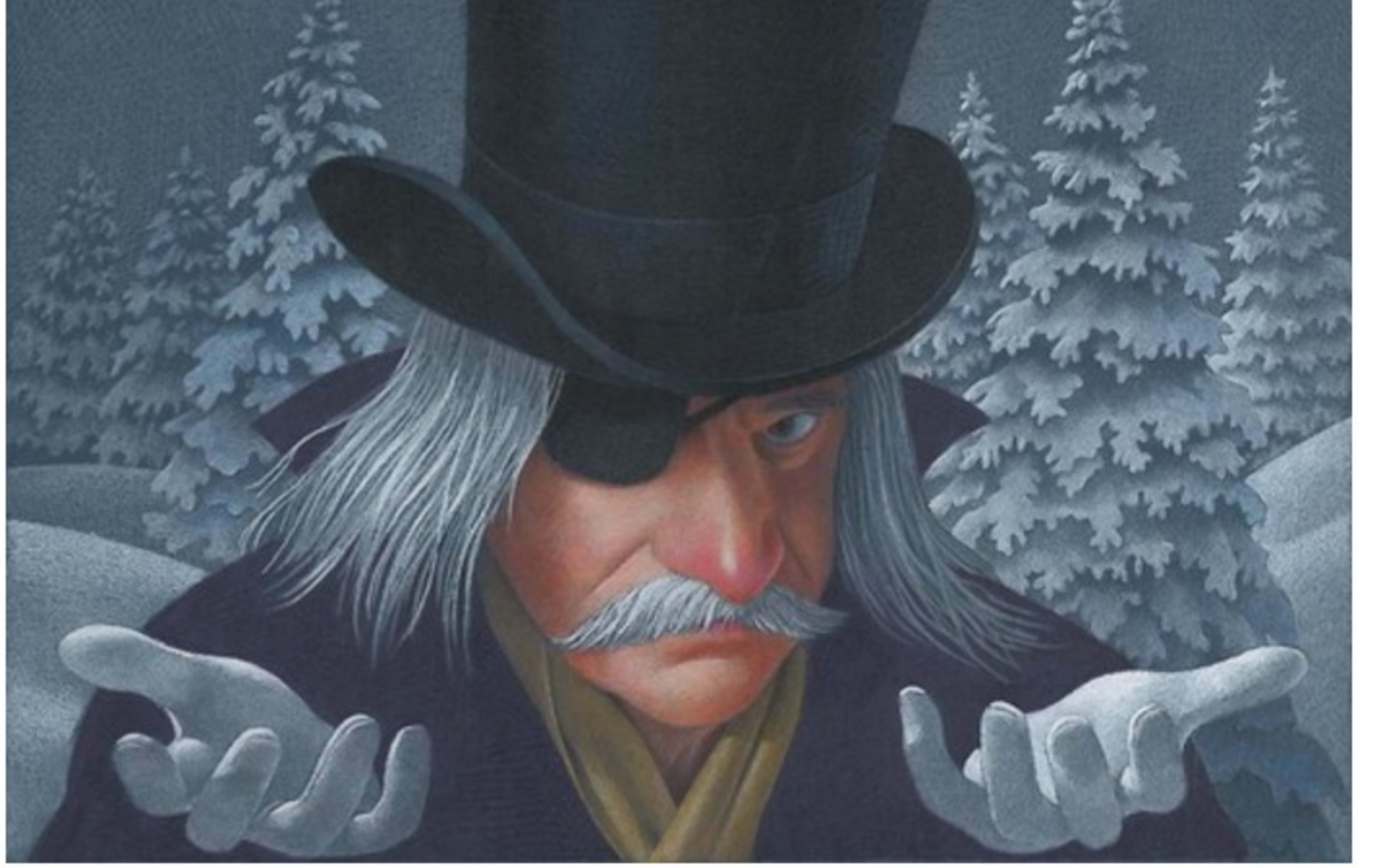
Chris Van Allsburg's original artwork is a part of the set design of Grand Rapids Ballet's new "Nutcracker"