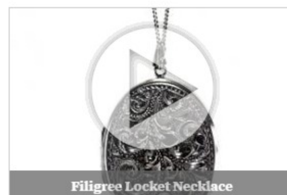
Filigree Locket Necklace